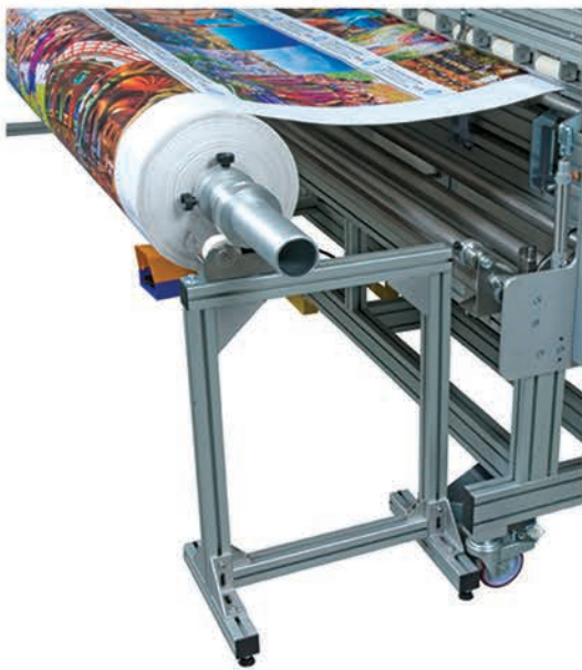
Heavy Duty Roll Feeder

The XL Series can handle media with a maximum thickness of 40 mil including polycarbonate, laminates and encapsulated media, photo paper, vinyl, self-adhesive vinyl, graphic arts film, duratrans, canvas and much more.