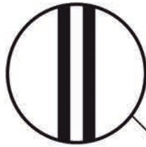
FOTOBA CUT MARK

The FOTOBA XL series cutters are super fast to eliminate the bottlenecks in your finishing department. A single cutter is capable of handling the output of several printers. The XL cutters uses FOTOBA CUTMARKS to follow the edge of the image. Regardless of any feed misalignment, the XL Cutter will automatically realign itself to the edge of the printed image. The XL cutter will always produce square finished images even if the printer fails to print parallel to the media edge or if the printer fails to wind up the rolls squarely (telescoping).