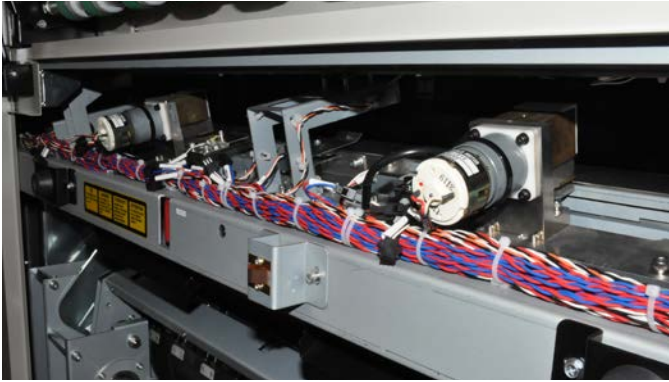
On-line press punching