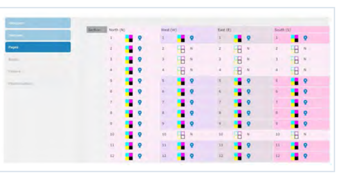
View of in-built planner

Printers who work with remote publishers will appreciate the benefits of Arkitex Portal, which is a collaborative page production system. Portal offers a cost-effective way to help newspaper publishers and printers expand and develop their print business.