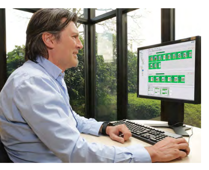
One screen can show pages, plates and device status