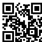
Remote proofing and page approval

Click on the QR codes to watch instructional movies.