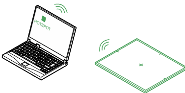
Figure 1: The workstation is standby