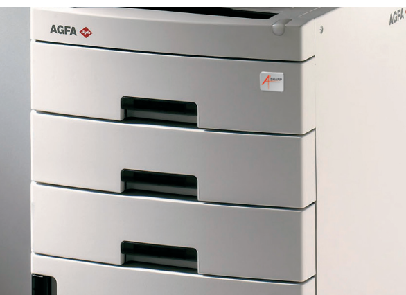
Three media trays for different on-line media sizes